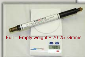
Full = Empty weight + 70-75 Grams