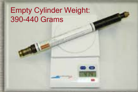
Empty Cylinder Weight: 390-440 Grams

Prior to Filling: Weigh empty cylinders in grams using a food or postal scale. Empty cylinders weigh between 390 and 440 grams. Mark the empty weight on each cylinder.